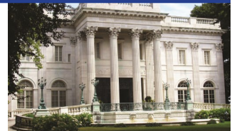
See inside an opulent Newport mansion

Day 3: After Breakfast, you will head to Mystic Seaport. A quintessential New England experience, Mystic Seaport offers visitors a unique opportunity. Discover maritime history firsthand via their re-created seafaring village that is bustling with the sights and sounds of 19th-century life. No matter the season, there's always something to do at Mystic Seaport. Then, it is time to depart for home... a perfect time to chat with your friends about all the fun things you have done, the great sights you have seen, and where your next group trip will take you!