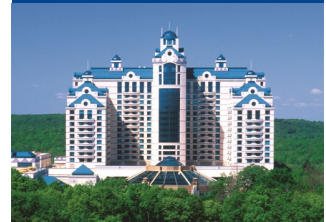
Gaming at the magnificent Foxwoods Resort Casino!