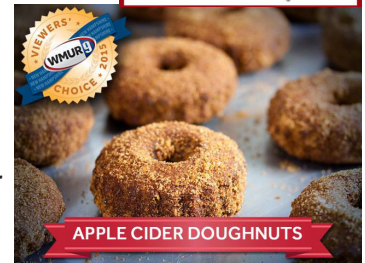
APPLE CIDER DOUGHNUTS