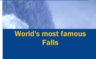
World's most famous Falls

Day 7: Today after enjoying a Continental Breakfast, you depart for home... a time to chat with your friends about all the fun things you've done, the great sights you've seen and where your next group trip will take you!