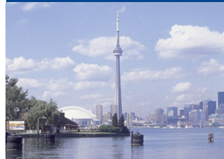
The magnificent CN Tower in Toronto